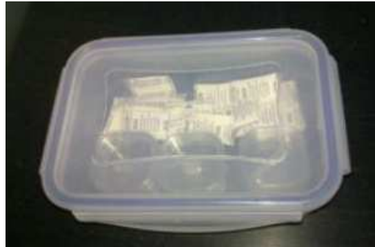
2 Fig. Storage example of humidity-sensitive articles.